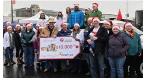
7Cares Idaho Shares day in Boise, Idaho