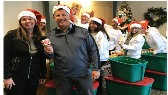
Live Broadcast at the Optum Office for 7Cares Idaho Shares